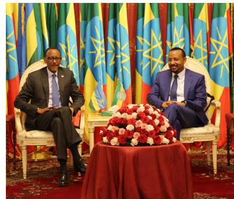
President Paul Kagame and PM Abiy Ahmed