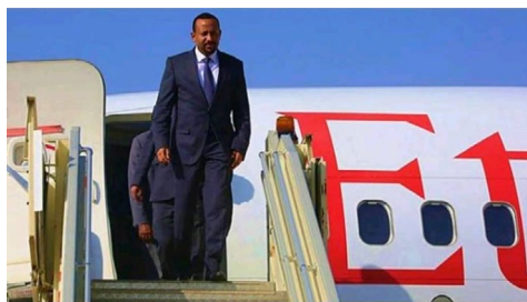
PM Abiy Ahmed arriving in Saudi Arabia