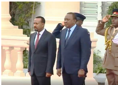
PM Abiy Ahmed and President Uhuru Kenyatta