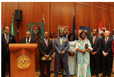
HE Badr Abdelatty opening Berlin's Africa celebration, held in the Egyptian embassy.

Africa Day was celebrated on May 25 under the theme “The Year of Combating corruption; a sustainable path to Africa's