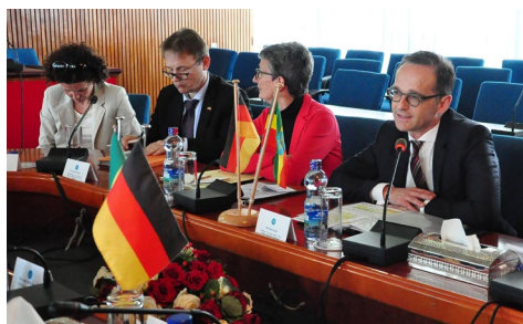
Heiko Maas (right) in Ethiopia