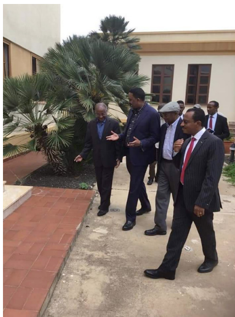
Foreign Minister Workneh Gebeyehu visiting the site of the future Ethiopian Embassy in Eritrea