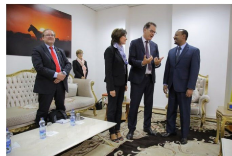
Minister Müller and PM Abiy