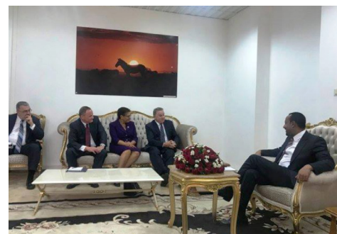
Congressman Christopher Smith with PM Abiy